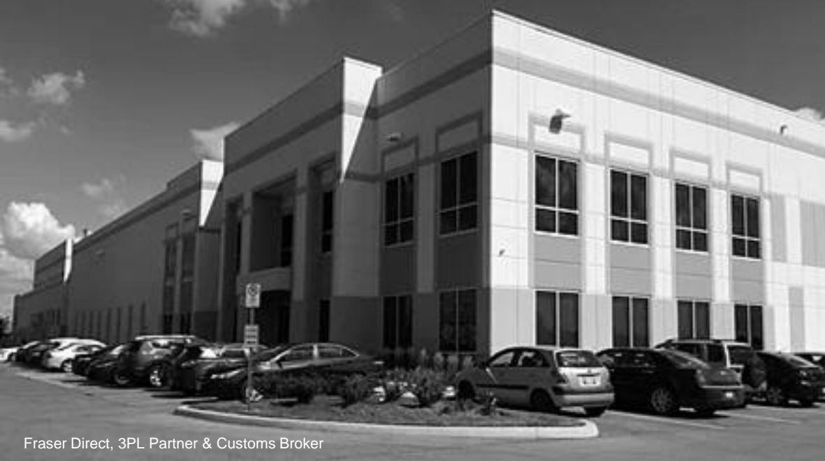
Fraser Direct, 3PL Partner & Customs Broker