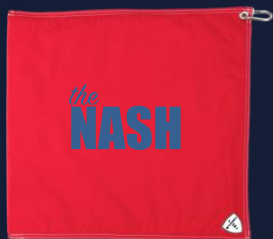
UV-Coated Triple Stitching