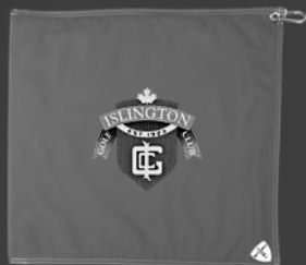
Super-strong Marine-Grade Stainless-Steel Components